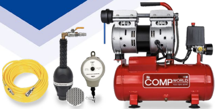
Meat mallet package