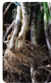
Before peeling skin