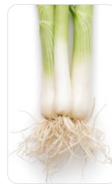
After peeling skin