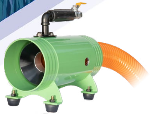
Portable 1-prong Stripper (PSR360)

※ Configurable for input type selection (e.g. spring onion + spring onion, spring onion + chives, chives + chives)